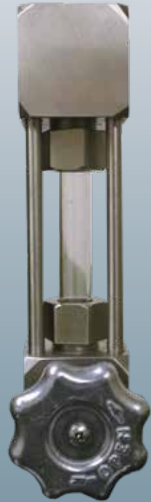
STAINLESS STEEL SIGHT GAUGE VALVE ASSEMBLY