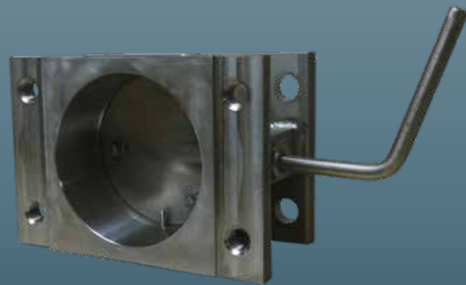
STAINLESS STEEL PUMP SUCTION ISOLATION VALVES